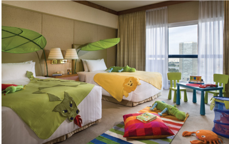
Kids' room/ Swissôtel Tallinn

Tips for families with children and others: LENNUSADAM, a harbour originally built for seaplanes in the 1920s. Today it is part of the Estonian Maritime Museum, where you can also see a submarine, an old icebreaker and other ships that you can also visit inside. Check out http://www.meremuuseum.ee/?setlang=eng . Other tips: Tallinn's new Museum of Puppet Arts and the hidden tunnels under the Toompea Bastions in the Old Town.