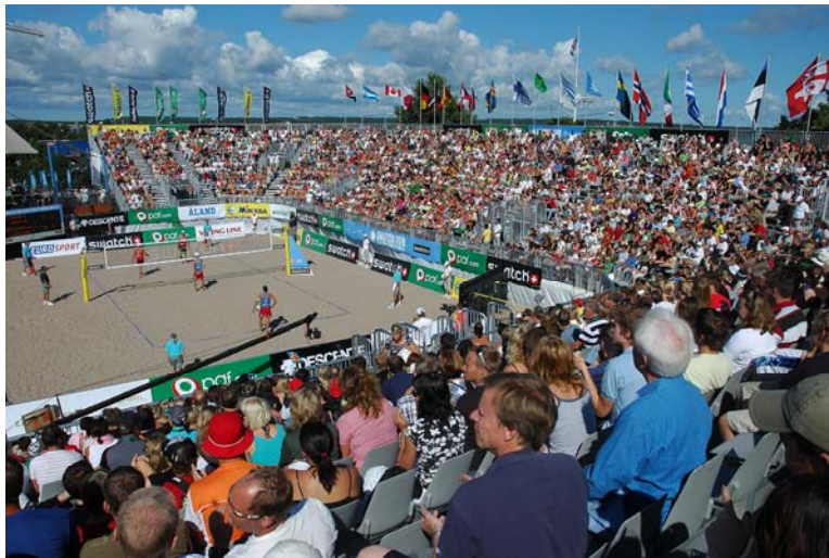
Paf Open 2009 Swatch FIVB World Tour in beach volleyball

Åland is popular among golfers. The Åland Golf Club is known as one of the most beautiful golf courses in the Nordic countries, offering great playing opportunities into October. Eckerö Golf, located in Kyrkoby Eckerö, is Ålands other big golf course, where players without a green card are also welcome. Viking Line has specially tailored golf packages, offering various overnight accommodations within walking distance of the gold courses.